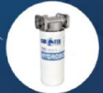
IN LINE PARTIAL SEPARATION FILTERS