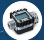
DIGITAL FLOW METERS