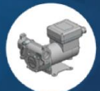
ENGINE DRIVEN OR ELECTRIC PUMPS