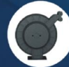
UP TO 10M OR 32FT RETRACTABLE HOSE REELS