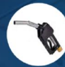
DISPENSING NOZZLE VARIATIONS

The range has an extra large equipment compartment area that can house a variety of accessories.