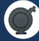
UP TO 10M OR 32FT RETRACTABLE HOSE REELS