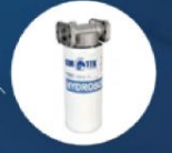
IN LINE PARTIAL SEPARATION FILTERS