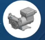
ENGINE DRIVEN OR ELECTRIC PUMPS