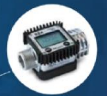
DIGITAL FLOW METERS