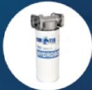
IN LINE PARTIAL SEPARATION FILTERS