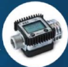
DIGITAL FLOW METERS