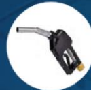
DISPENSING NOZZLE VARIATIONS

The range has an extra large equipment compartment area that can house a variety of accessories.