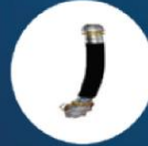
HOSES WITH ISO QUICK RELEASE COUPLERS