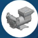
ENGINE DRIVEN OR ELECTRIC PUMPS