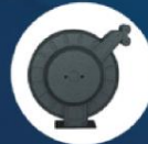
UP TO 10M OR 32FT RETRACTABLE HOSE REELS