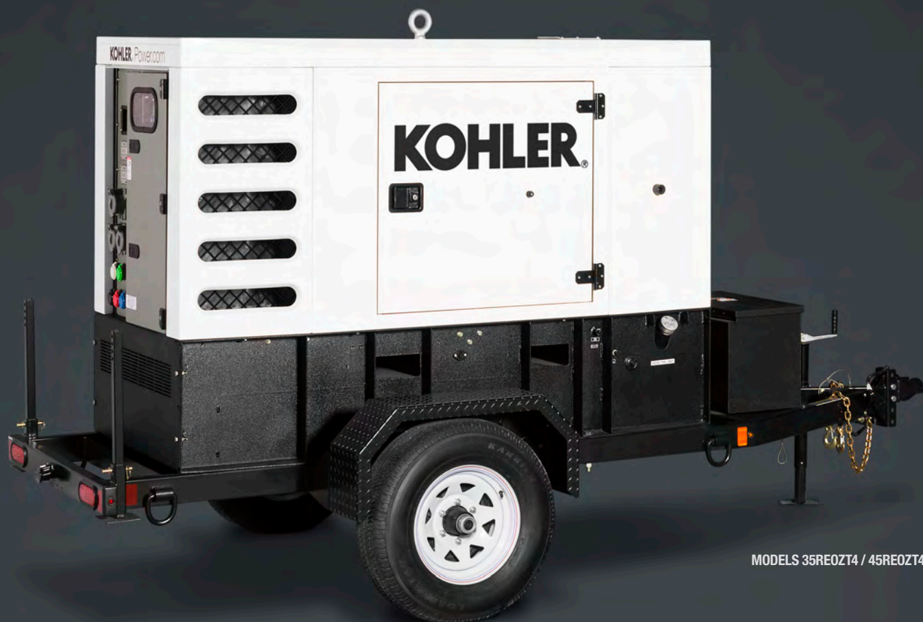
MODELS 35RE0ZT4 / 45RE0ZT4